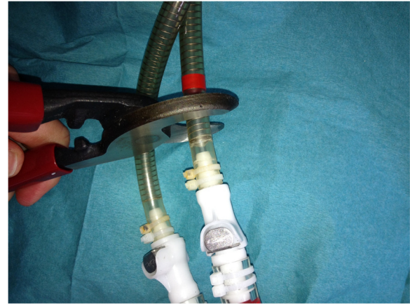
Figure 3 Cutting off the left driveline with the high leverage cable cutter.

intolerance. Therefore it is important to identify and repair quickly the defect. Other currently available repair techniques include banding the driveline with a silicon tube [3] or sealing it with cyanoacrylate adhesive. However this is only a provisory repair. Since the U.S. Food and Drug Administration (FDA) has approved a Humanitarian Use Device (HUD) designation for the SynCardia temporary Total Artificial Heart to be used for destination therapy in patients not being eligible for transplantation [4] and since the durability of the driveline could limit successful long-term support [5], the aim should be to definitively repair any driveline defect. As in this case, the repair can be easily facilitated by cutting the driveline at the location of the tear and reconnecting to the air tubes. During repair