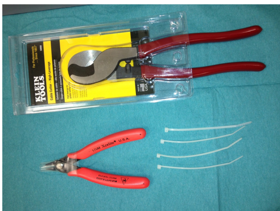
Figure 2 Set of tools: Xcelite 170 M general purpose shear cutter (Apex tool group, Sparks, MD, USA), high leverage cable cutter (Klein Tools, Lincolnshire, IL, USA), cable ties.

Received: 16 September 2013 Accepted: 30 December 2013 Published: 7 January 2014