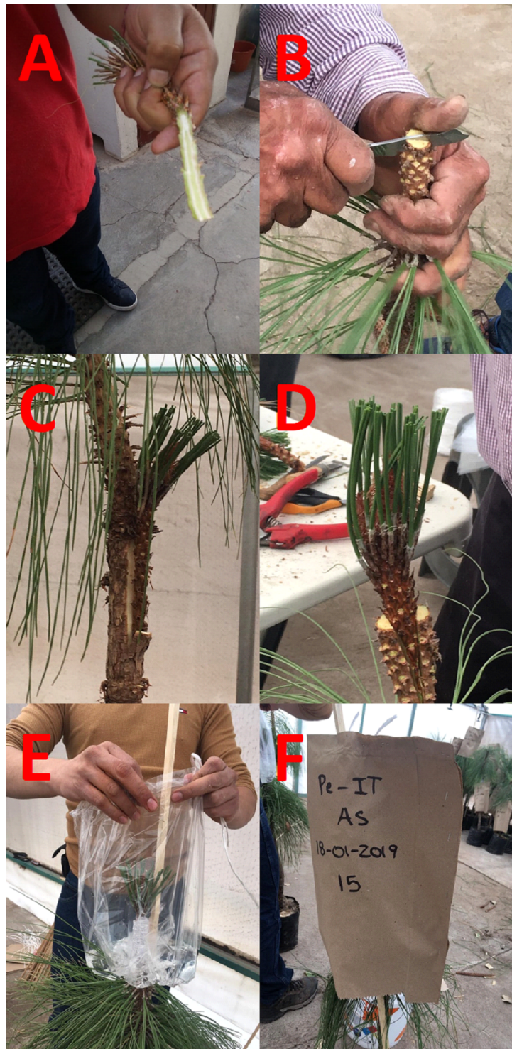
Figure 1 Grafting techniques and graft protection. (A) Preparation of the scion used for a side veneer graft; (B) a tied side veneer graft; (C) preparation of rootstock for a top cleft graft; (D) a tied top cleft graft; (E) a plastic bag being placed over the grafted area containing water to generate the wet microclimate; (F) protection of the grafted area with a kraft paper bag, to protect the area from direct solar radiation.