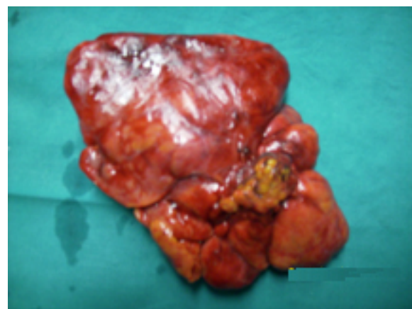
Figure 3 Example of POT. A normal appearing omentum was above the torsion point. You can see the vascular hanged and the torsion point with the distal thickened and congested omentum.

POT is a rare pathological condition which presents with generic symptoms, and may mimic a variety of acute abdominal conditions such as cholecystitis, acute diverticulitis, appendicitis [6] and Meckel diverticulum