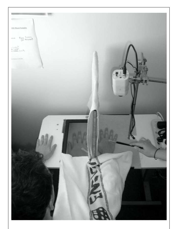
FIGURE 1 | Photograph of the projected-hand illusion is shown.

if the hand was a left or right hand by pressing an appropriate key on a keyboard. Each picture was either a left or right hand and rotated by either 0°, 90° medially, 90° laterally, or 180°. There