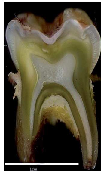
Fig. 1: Macroscopic view of a longitudinal section of a green primary molar from one of the studied patients.

Sixteen primary green teeth were prepared and divided into two groups. In the group of green teeth, eight teeth were selected: two (25%) canines and six (75%) incisors. In the control group, eight teeth from healthy children were used: two (25%) canines and six (75%) incisors. The control teeth were matched with green teeth so that each group had the same amount of teeth in the same anatomical group and also paired by patients' age. All teeth were prepared based on previous studies (17,18)