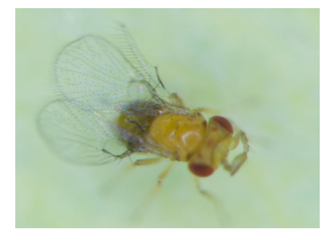
Figure 1. Female Trichogramma chilonis . Real size = 1 mm.

To better understand how the structure of environmental variation impacts population establishment, we investigated the respective influence of external, uncorrelated variations in carrying capacity versus variations generated by the host–parasitoid interaction on the dynamics and persistence of introduced parasitoid populations in an experimental system. More specifically, we tested the predictions that uncorrelated environmental variation decreases population size (Benton et al. 2001) and increases population variability and extinction probability (Drake and Lodge 2004). In contrast, as parasitoids are sensitive to intraspecific competition and may display overcompensatory dynamics (Taylor 1988), we hypothesized that autocorrelated variations in host abun-