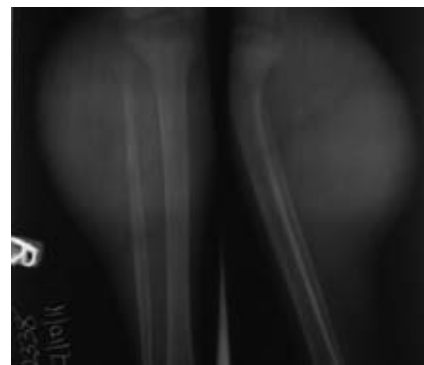
Figure 1. Plain x-ray of the patient before surgery shows an extensive soft tissue swelling.

Histology showed fibrocollagenous tissue composed of adipose tissue and numerous thin-walled and congested vascular vessels. Also seen were chronic inflammatory cells, mainly lymphocytes and plasma cells. No evidence of malignancy seen in all the sections examined. Findings were consistent with angiofibrolipoma (Figure 3).