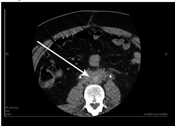
CT scan without contrast shows a soft tissue mass (arrow) which is located in the retroperitoneal area at the level of the fourth and fifth lumbar vertebrae.