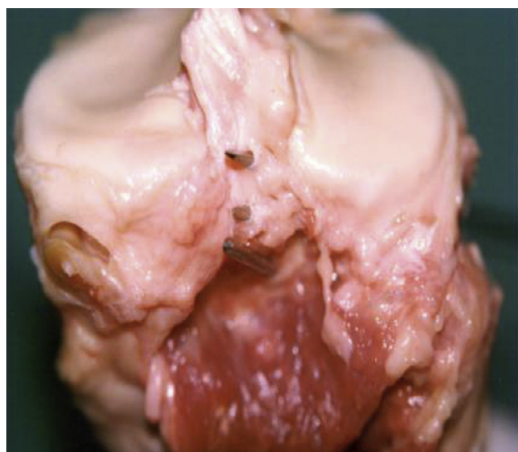
Fig. 3 – Image of the posterior region of the knee after dissection, which shows the exit point of the guidewires.