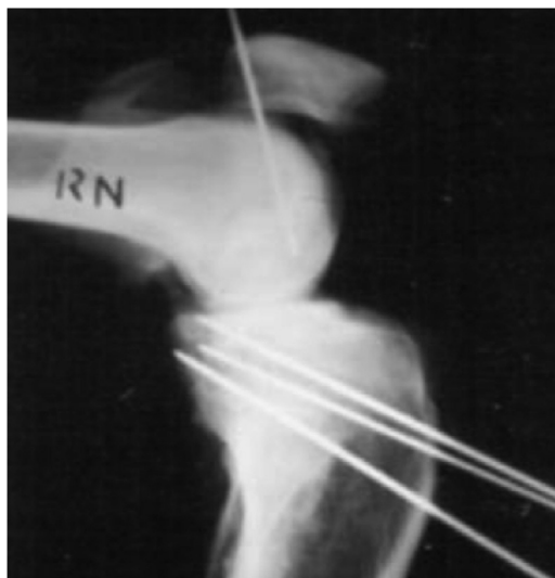
Fig. 2 – Positioning of the three Kirschner guidewires, respectively at 0, 10 and 15 mm distal to the posterior crest of the tibia.