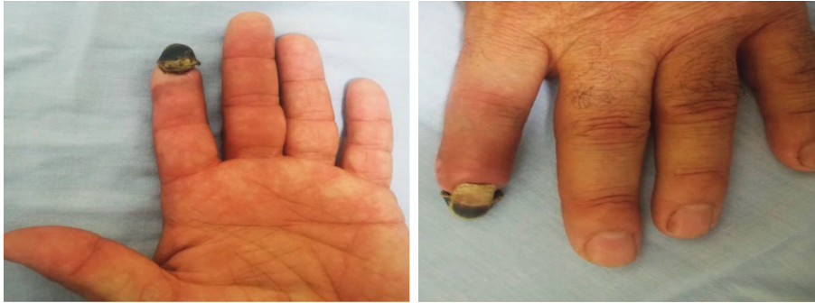
FIGURE 3: Photo of the patient's left hand showing the gangrenous distal phalanx of his left index finger.

Health Organization released in March 2021 that the available data on AstraZeneca did not show any increased risk of clotting events despite having few cases reported on unique thromboembolism [10]. The earliest reported cases were the atypical venous thrombosis, mainly intracranial [1], which were challenging to treat [9]. Young females were mostly affected [1] and mostly presented within one to two weeks after receiving the vaccine [1, 9, 10]. The great majority of patients were previously healthy and fit [11]. So when a patient presents with headache, abdominal pain, shortness of breath, and/or limb swelling postvaccination, a platelet count and imaging for thrombosis must be carried out [12].