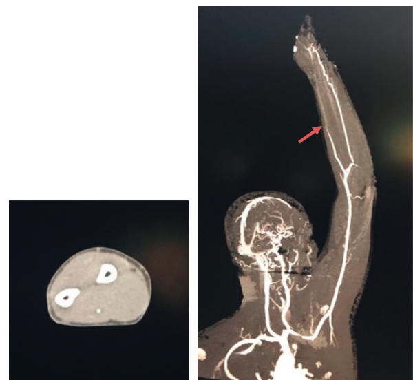
FIGURE 2: IV contrasted CT scan showing occlusion of the left radial artery at the level of the midforearm with retrograde filling at the level of the left rest.

The patient was admitted under the care of the cardiovascular team as a case of upper limb ischemia for observation and therapeutic anticoagulation. Four weeks later, our patient presented to the clinic with improvement of his symptoms and reversal of tissue ischemia except for dry gangrene in his distal phalanx of the left index, which was left for autoamputation (Figure 3).