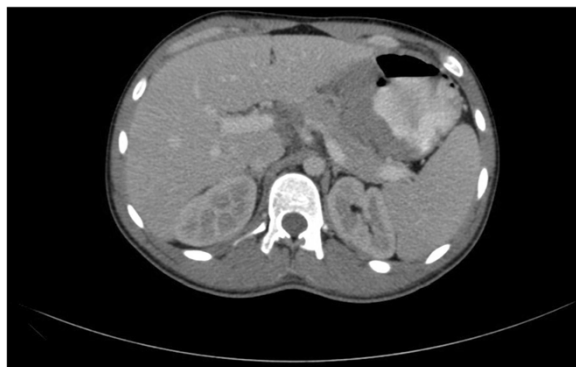
Figure 2 Findings in abdominal computed tomography consisting of a gastric mass.

PG-DLBCL usually affects patient between the 4 th and 6 th decades of life. In one study, the mean age was 57.7 years [3] while the median age was even higher in another [2]. There is a slight male preponderance [2]. Cases among individuals prior to the second decade of life are unusual. According to the IDF recruits database, only 2 cases of gastric malignancies were reported during the last 5 years, one of them was MALT NHL, the other being a carcinoma.