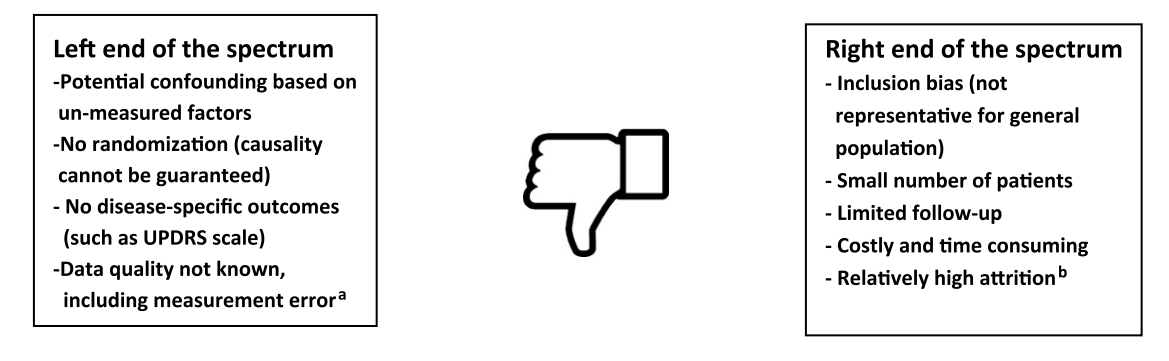
Fig. 1. This figure shows the RCT and analyses of medical claims as two extreme ends of the spectrum of study designs, with a low versus a high level of control. In between these two extremes, there are a number of alternative designs, and some of thesehave been included as examples here. <sup>a</sup>Measurement error refers to the fact that in medical claims, conditions are defined imprecisely and inaccurately, that measurement may vary in a biased way, and that little is known about how robust the measures are. <sup>b</sup>Attrition rate is a problem for any study design. RCTs actually perform reasonably well by comparison to other clinical studies.

may offer a potential solution for this [22]. Finally, just as in RCTs, researchers who analyze medical claims must define a primary outcome at the outset, prior to performing the analyses. The number of possible outcomes in a medical claims database is almost infinite, creating a risk of spurious findings unless a predefined primary outcome is decided upon before embarking upon the analyses.