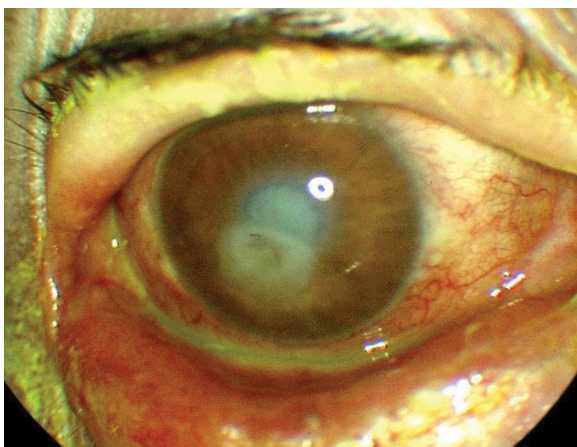
Figure 2 The color photograph shows the corneal perforation, cataractous lens, the lower ectropion, shallow anterior chamber, and conjunctival congestion in the right eye.

Ichthyosis is a skin disorder characterized by excessive dryness of skin and increased formation of epidermal scales. There are four types of disease including ichthyosis vulgaris, sex-linked recessive, lamellar ichthyosis, and epidermolytic hyperkeratosis. The rarest form is lamellar ichthyosis, which has autosomal recessive inheritance and is due to a defect on chromosome 14q11 encoding transglutaminase-1 (TG). 2 The association between ichthyosis and cicatricial ectropion, which is the most common eyelid malposition, was first reported in 1834. 3 secondary to chronic exposure, corneal ulceration and perforation may occur in these patients. 4 Cruz and colleagues postulated that corneal damage is not directly linked to lower ectropion. Apart from ectropion, the other factors causing corneal damage are madarosis, conjunctivitis, eyelash retraction, and lagophthalmus. 1 In patients with chronic corneal involvement, preservative-free artificial tears, petroleum-ointment, bandage contact lenses diminish symptoms and