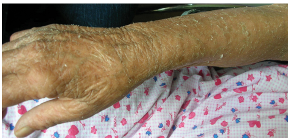
Figure 1 The color photograph shows the scaling and the dryness on the skin of arm.

patient we found that she was deceased due to septic shock five months after presentation to our clinic.