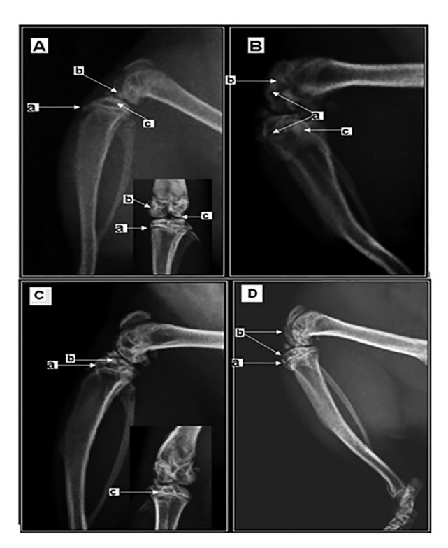
Fig. 1 - Radiological image of the right knee. A - A CGA animal on day 45 of the experiment presenting aspects compatible with normality. The arrow (a) indicates full epiphyseal line, the trabecular bone in the femur is regular (arrow (b)) and the regularity of the articular surface of the tibia and femur, indicated by the arrow (c). B - A GE animal (10<sup>5</sup> yeast cells) on day 45 of the experiment displaying severe arthritis with joint destruction (arrow (a)), the absence of the patella-femoral joint space, shown by the arrow (b), and the absence of the epiphyseal line (arrow (c)). C - A GE animal on day 45 (inoculated with 10<sup>4</sup> viable yeast cells) at the end of the study presents radiological findings consistent with mild arthritis. (a) Tibial subchondral cysts, (b) discontinuity of the articular surface of the tibia and (c) points to a deformity of the epiphyseal line adjacent to a subchondral cyst. D - A GE animal on day 15 (inoculated with 10<sup>3</sup> viable yeast cells) presenting radiological findings consistent with mild arthritis. It is observed that the epiphyseal line is preserved (a) and that there are lytic lesions in the tibia and patella.

GE - 10^3 - Experimental group inoculated with 10^3 viable yeast cells; GE - 10^4 - Experimental group inoculated with 10^4 viable yeast cells; GE - 10^5 - Experimental group inoculated with 10^5 viable yeast cells; GCN - 10^3 - Experimental group inoculated with 10^3 heat-inactivated yeast cells; GCN - 10^4 - Experimental group inoculated with 10^6 heat-inactivated yeast cells; GCN - 10^5 - Experimental group inoculated with 10^5 heat-inactivated yeast cells; GCA - Absolute control group.