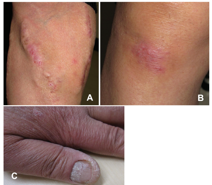
Figure 1. The patient showed psoriatic eruptions on the surface of hemodialysis shunt (A) and on the left knee (B) with hyperkeratosis and discoloration in fingernails (C).

Approximately 10 months later he noticed eruptions on his head, elbows, fingers and knees with hyperkeratosis and discoloration in his nails, which were clinically diagnosed as psoriasis by a dermatologist, in conjunction with worsening of his systemic arthritis and elevations of CRP (3.31 mg/dL) (Fig. 1). The psoriasis area and severity index (PASI) was relatively low (6.0), but DAS28-CRP indicated high disease activity of arthritis (6.88). Adalimumab was started at 80 mg initially, followed by 40 mg every other week. The patient showed dramatic improvement of his arthritis as well as psoriasis, and DAS28-CRP and PASI decreased to 2.41 and 2.8, respectively, 2 weeks after starting adalimumab (Fig. 2). On flow cytometry before treatment CD4 + interferon- \gamma + (Th1) and CD4 + interleukin-17 + (Th17) cells in peripheral blood were higher than those of age-matched healthy controls, but CD4 + CD25 + FOXP-3 + cells (Treg) showed no obvious increase. All of these lymphocyte subpopulations were decreased eight weeks after starting adalimumab compared with before (Fig. 2). CD4 + interleukin-4 + cells (T-helper 2) showed no significant change before and after treatment. Twelve weeks after starting adalimumab, CD4 + interleukin-17 + and CD4 + CD25 + FOXP-3 + cells returned to the pretreatment level but CD4 + interferon- \gamma + cells remained at low levels. He has since been in good general health