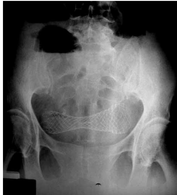
Photo 1. Abdominal X-ray taken in a standing position. The intestinal obstruction was eliminated by means of endoprosthesis placement. The endoscopically inserted self-expandable metal prosthesis can be observed in the mid-hypogastrium, overpassing the malignant obstruction of the sigmoid colon. The hepatic colonic flexure is still dilated and overflowed with intestinal gases with visible air-fluid levels. The left colon was decompressed of retained fecal masses

Approximately 30% of colorectal cancer patients present with an acute gastrointestinal tract obstruction. This requires an emergent surgical intervention due to the massive dilation of the intestine, associ-