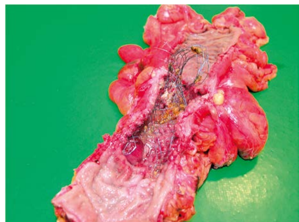
Photo 3. Anterior resection of the rectum. Surgical specimen of the large intestine with carcinoma of the rectosigmoid junction which obstructed the intestine entirely. The patency was restored by endoscopic insertion of a self-expandable metal stent