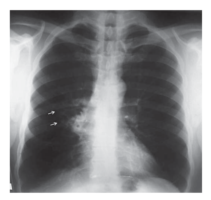
Fig. 1. Chest X-ray showing coarse reticular infiltration extending from the right hilum to the periphery (arrows).

surgical treatment (right lobectomy), he was referred to another hospital where advanced thoracic surgery facilities are available. There, he had another bronchoscopic examination, traditional rigid bronchoscopy not combined with a flexible bronchoscope, reporting no endobronchial abnormality. He was then readmitted to our hospital. Although he denied a new episode of lithoptysis, he again underwent a bronchoscopic examination with a flexible bronchoscope to protect him from further unnecessary surgery. After we were sure that the broncholiths were still present, we suggested to him a surgical treatment, right middle lobectomy, but he refused.