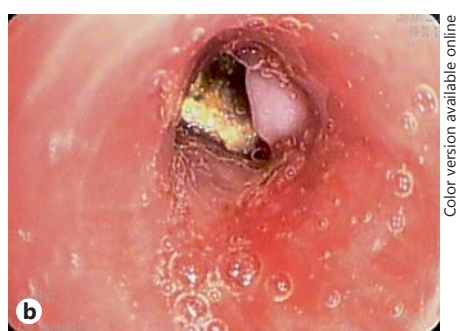
Fig. 3. Anterior segment of the RUL bronchus ( a ) and distal portion of the middle lobe bronchus ( b ).

terior segment of RUL, which have been known as preferential sites of broncholiths because of airway anatomy and lymph node distribution [3].