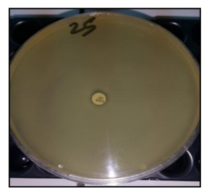
Figure 2: Disc diffusion susceptibility test showing Temocillin resistant strain (OXA48 producer)