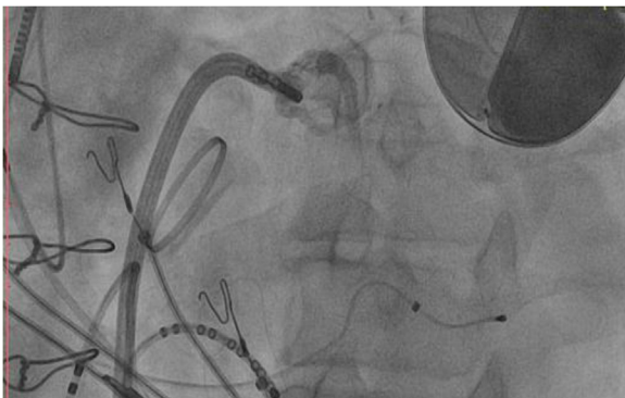
Figure 2 Fluoroscopic left anterior oblique view of the transseptal sheath across the aorta with contrast in left coronary arteries.

possible reason is that the existence of pericardial adherence following previous cardiac surgery prevents the occurrence of pericardial effusion.