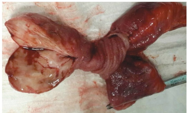
FIGURE 3. Stromal tumor that caused invagination.