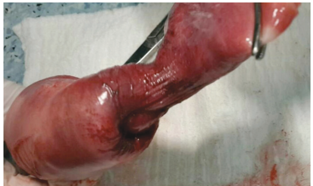
FIGURE 2. Macroscopic appearance of invaginated ileal loop.