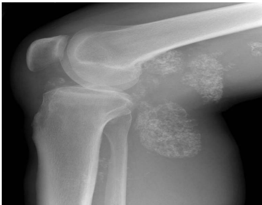
Figure 1 Plain radiograph and magnetic resonance imaging scans showing multiple soft tissue calcifications within and outside the joint capsule of the right knee.

Cartilage cells are absent inside the synovial membrane. It follows therefore that the development of synovial