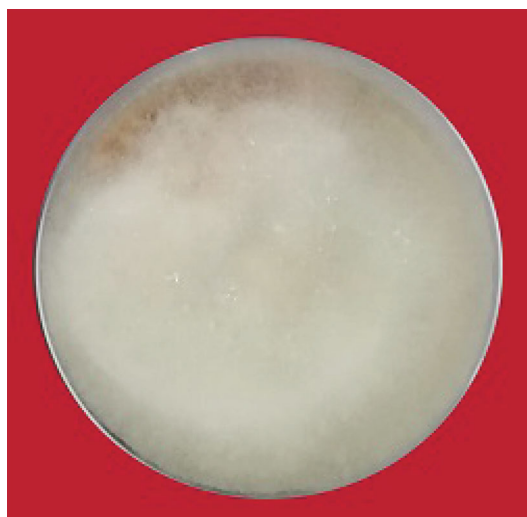
FIGURE 1: M. circinelloides culture.

2.5. Antimycotic Activity. The antimycotic study of leaf extracts of selected medicinal plants was determined by using the disc diffusion method [12]. Filter paper discs of 6 mm diameter were soaked with 1 ml of extracts. Sabouraud's Dextrose Agar (SDA) plates were inoculated with M. circinelloides culture by point inoculation. The plates were done in triplicates and were incubated at 28°C. The antimycotic activity was taken on the basis of diameter of zone of inhibition, which was measured after 7 days of incubation, and the mean of three readings is presented.