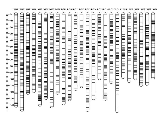
Figure 1. Genetic lengths and marker distribution of 24 linkage groups (LGs) in the sex-averaged linkage map of the European seabass.