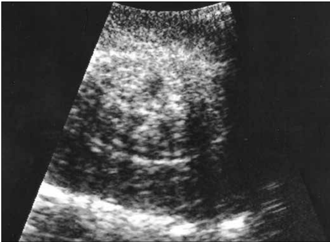
Figure 3. Ultrasound of the corpus cavernosum.

Mean surgery time: 94 minutes, range from 70 to 150 minutes. Urethral repair was required in 2 patients and they did not have any urinary problem after 1 year of follow up. The hospital length stay was 2 days, ranging from 1 to 5 days.