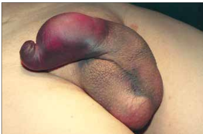
Figure 1. Penile hematoma.

The mean age of patients was 30.7 years, range from 19 to 37. All the patients came complaining of penile swelling and hematoma, and more than half of them (60.7%) reported hearing a snap sound. The summa-