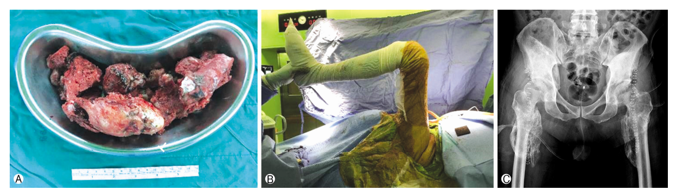
Fig. 3. (A) Gross specimen showing multiple bone fragments with hemorrhage. (B) Passive flexion of the left hip joint was available after surgical removal of heterotopic ossification. (C) Immediate postoperative pelvis anteroposterior radiograph shows a decreased extent of heterotopic ossification compared with that in the preoperative pelvic radiograph.