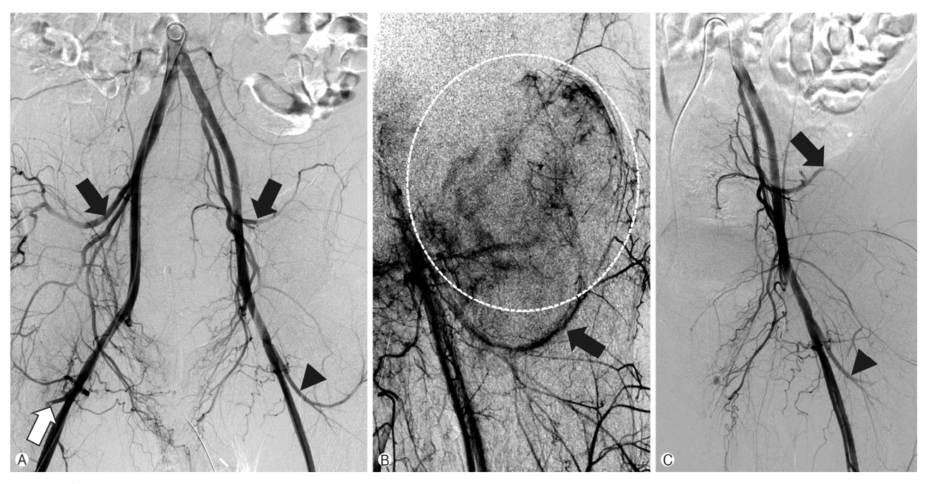
Fig. 2. (A) Common iliac arteriogram reveals hypertrophied bilateral superior gluteal arteries (black arrows), left lateral circumflex femoral artery (arrowhead), and the stump of right lateral circumflex femoral artery (white arrow), which was ligated during the previous surgery. (B) External iliac angiography demonstrates hypertrophied left lateral circumflex femoral artery (arrow) and diffuse hypervascular area involving the left hip joint (dashed circle). Note that the left lateral circumflex femoral artery arises from common femoral artery, as a normal anatomical variant. (C) Angiography obtained after embolization with gelatin sponge slurry shows decreased vascular flow in the left superior gluteal artery (arrow) and lateral circumflex femoral artery (arrowhead).

ALP levels were measured during follow-up outpatient appointments until the HO matured. During the 1-year follow up, ALP levels fell within the normal range, and the patient decided to undergo surgery for persistent hip contracture and limited ambulation necessitating wheelchair usage. Preoperative CT with contrast enhancement showed heterotopic bone formation in both hip areas. Hypertrophied bilateral superior gluteal and lateral circumflex arteries supplying the hetero-