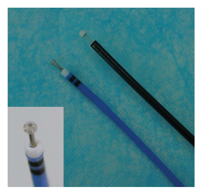
FIGURE 1. O-type HybridKnife. The larger figure demonstrates the side-by-side comparison of O-type HybridKnife to IT2 knife while the smaller insert highlights the tip of the HybridKnife, a circular insulated tip except for the center where the metal needle tip for injection went through. Marking, injection, mucosal cutting, submucosal dissection, and hemostasis can be performed with 1 device.

E ndoscopic submucosal dissection (ESD) has gained accep-tance as the first line treatment option not only in East Asia including China, Japan and Korea, but also worldwide.<sup>1-4</sup> Although clinical long-term outcome showed excellent results,<sup>5</sup> ESD remains to be a technically challenging and time consuming procedure compared to other endoscopic resection methods including endoscopic mucosal resection (EMR).<sup>6,7</sup> Modifications on devices and methods of ESD have been attempted. The HybridKnife, a new system which combines electrosurgical technology with a water-jet system (ERBEJET2; ERBE, Tübingen, Germany), allows rapidly injection of solutions into the submucosa to form a fluid cushion without exchanging instruments. It has been previously shown to be effective and safe in animal studies and clinical trials.<sup>8-11</sup> Recently, a new type of HybridKnife (O-type HybridKnife, Figure 1) was developed with a partially insulated tip. However, little was known if the built-in injection capability would help to reduce ESD procedure time. In the present study, we conducted a randomized, controlled prospective study to evaluate the efficiency of O-type