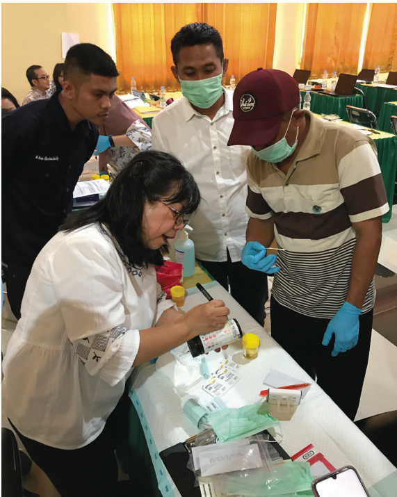
Photo: INA-RESPOND Laboratory Director conducting training at local health centers in Indonesia prior to the COVID-19 pandemic.

a 2007 request from the MoH for greater scientific engagement with the US. Through bilateral support, significant research infrastructure was established over the next 3 years, allowing INA-RESPOND to complete observational studies on sepsis [6] and the etiologies of fever causing hospitalization [2]. The success of these studies led to renewal of the partnership and the initiation of observational cohort studies on HIV (NCT03663920) and tuberculosis (NCT02758236), an observational study on causes of pediatric pneumonia (NCT03366454), an interventional study on HIV treatment (NCT03017872), and a diagnostic study on Schistosoma japonicum infection (NCT03870204). As INA-RESPOND has grown, it has also begun collaborating with external groups at the Kirby Institute, Tokyo University, the RePORT consortium, and the INSIGHT network. Today, the network maintains a core secretariat that oversees finance, procurement, study monitoring, data management and analysis, protocol writing, manuscript preparation, and operations oversight, as well as a central reference laboratory that has become one of Indonesia’s most advanced research and diagnostic laboratories (Figure 1, Panel A).