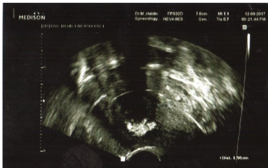
FIGURE 1: View of the uterus during abdominal ultrasonography.

was also seen. The patient underwent hysterosalpingogram which showed partial obstruction of the fallopian tubes. The patient was referred to conduct hysteroscopy for diagnosis and treatment. Hysteroscopy showed a large calcification with multiple calcific protrusions in the endometrium (Figure 2), and it was removed (Figure 3), and everything else was within normal limits. The calcification was sent to pathological analysis which concluded a leiomyoma with calcifications and no malignancy (Figures 4 and 5).