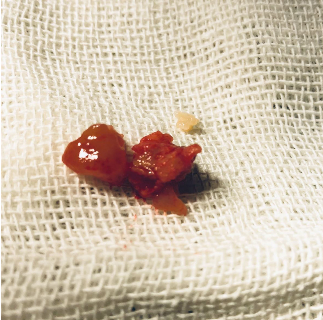
FIGURE 4: The gross view of the large calcification after removal.