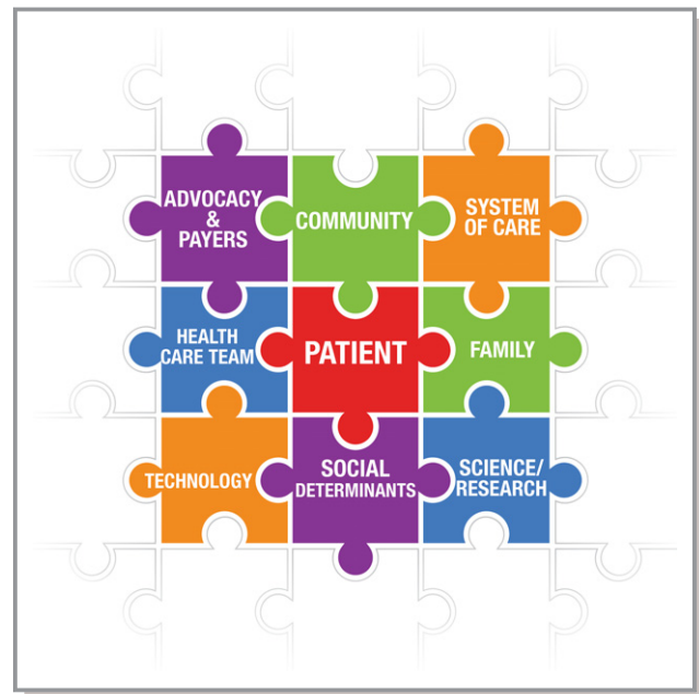
Figure 3. Unlocking the puzzle of caring for the patient with diabetes mellitus/cardiometabolic health conditions.

The solutions presented throughout the Cardiometabolic Health and Diabetes Summit fall within each of these categories. Each "puzzle" piece has its own potential barriers that need to be addressed to efficiently and effectively help