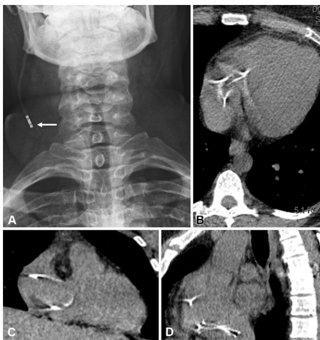
FIG. 3. Case 3. Shunt disconnection with distal catheter in right atrium. A: Radiograph demonstrating a disconnection of the distal tubing in the neck at the level of the connector ( white arrow ). B–D: Axial, coronal, and sagittal CTs of the chest demonstrating coiling of the distal catheter within the right atrium.

Eighteen patients with VA shunts were identified at our institution. Seven of these patients were identified as having a connector in the neck, three patients experienced shunt disconnection, eight patients had the distal catheter introduced via the internal jugular vein, and 10 had the catheter introduced via the subclavian vein. The use of a connector at the level of the clavicle for introduction of the distal catheter into the subclavian vein was not associated with disconnection.