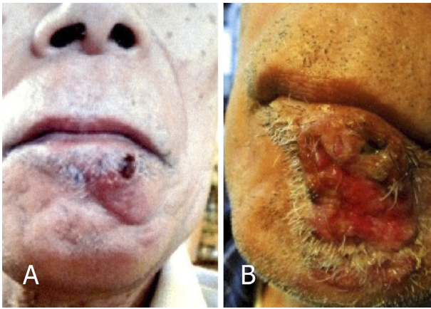
Figure 1. A cutaneous lesion of the left mandible. A: Three months prior to admission. There was an erythematous nodule beneath the lower lip. B: On admission, there was an erythematous multilobular lesion with ulcer that measured 5×3 cm in size on his left mandible.

fingolimod treatment, his lymphocyte counts were approximately 500/ \mu L. He denied any recent travel or close contact with birds.