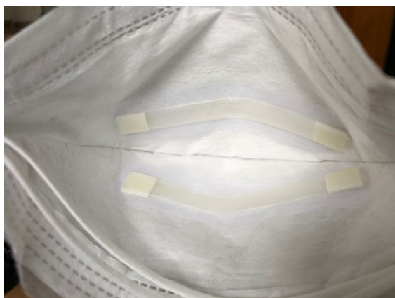
Figure 1 Two polyvinyl alcohol test strips adhered to the inside of a face mask.

The overall aim of this study is to analyse transmission clusters of SARS-CoV-2 in communities and identify factors