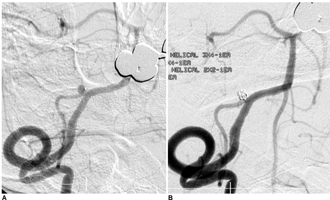
Fig. 1. Complete packing of aneurysm.

Note.— GOS = Glasgow outcome scale, VA = vertebral artery, PICA = posterior inferior cerebellar artery