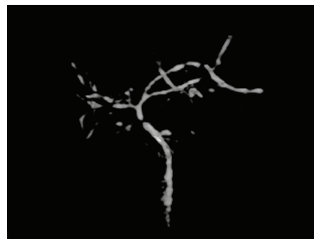
FIGURE 2: 3D MRI cholangiogram shows intrahepatic and extrahepatic biliary duct irregularity, with choledochus stenosis.

3.1. Patients' Characteristics. Of 64 adult CF patients followed up at our tertiary care center, 25 were included (Figure 1). Demographic characteristics at baseline are summarized in Table 1. Characteristics of studied patients were not statistically different compared to our whole CF population. However, patients included were more likely to receive UDCA (40% versus 13%, p = 0.028 ) and antifungal drugs (76% versus 31%, p < 0.001 ) than nonincluded patients. Only 6 patients included in our study had abnormal LFT and/or US abnormalities (hepatic dysmorphia, PHT signs, and gallstones). FEV1 median is 67.6% (50.4–84.8) in our 25 patients versus 71.2% (47.5–94.9) in the whole CF cohort ( p = 0.33 ).