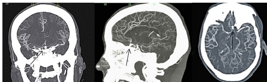
FIGURE 2 CT Cerebral Angiogram (Coronal/Sagittal/Axial view) demonstrating the ACOM aneurysm (arrow)