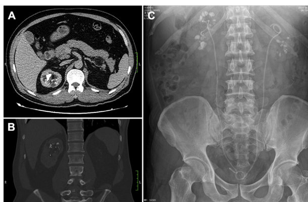
Figure 1 The radiological image in the computed tomography (CT) and kidney urinary bladder (KUB) radiograph. (A and B) Transverse section of the CT in excretory phase shows medullary cyst in the right kidney; (C) The Urinary tract plain X-ray has the characteristic appearance of a "bouquet of flowers" (We did not deal with the renal colic for without evident obstruction; postoperatively, two double-J ureteral stents were indwelling in bilateral ureters to keep the ureter open).

Upon admission, the plain film of the kidney, ureter, bladder (KUB) had the characteristic appearance of a "bouquet of flowers". The CT scan in the excretory phase showed a medullary cyst in the right kidney (Fig. 1). Additionally, our CT scan revealed multiple kidney stones and a right renal mass (renal carcinoma) (Fig. 2). A ultrasound of the urinary system also identified a slightly echoic region in the right lower kidney. A routine blood examination presented moderate anemia (hemoglobin: 86 g/L), while a renal function examination presented a serum creatinine level of 341 \mu\text{mol/L} and a uric acid level of 732 \mu\text{mol/L} . After treatment, serum creatinine and uric