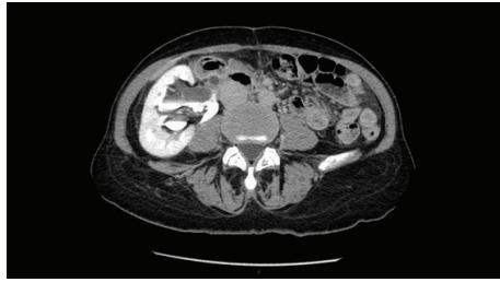
FIGURE 1: Right hydronephrosis with delay in opacification of right urinary system.