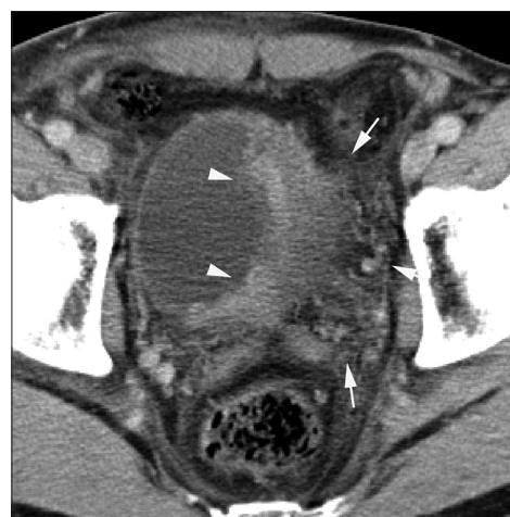
Figure 1: Postcontrasted CT image revealing an irregular thickening of the left side of the bladder wall (arrowheads) and a stranding of a surrounding fat tissue (arrows)

Polypoid and papillary cystitis should be considered in the