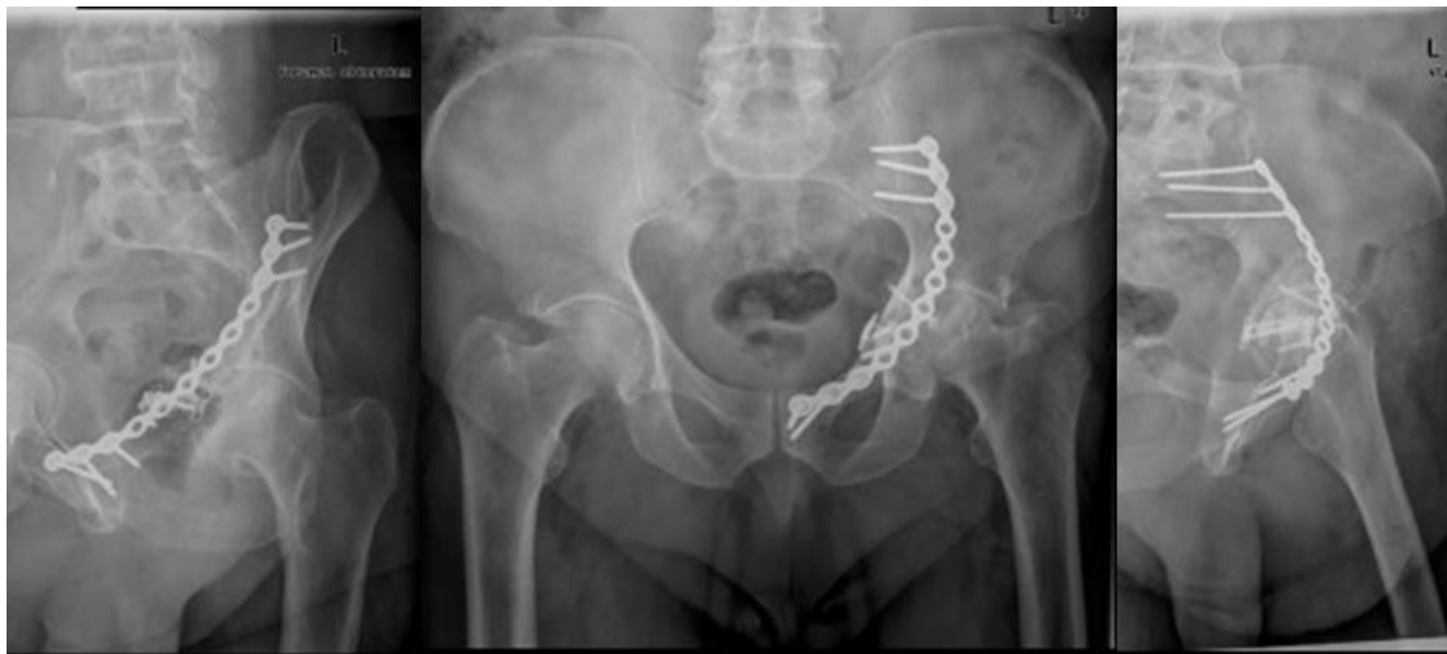
Figure 1 Postoperative radiographs.

Perioperative major-artery thrombosis during acetabular surgery is rare. In their description of the ilio-inguinal approach, Letournel and Judet reported one fatal case of arterial thrombosis [4]. To our knowledge, only one other case of ilio-inguinal-approach-associated arterial thrombosis not caused by vascular entrapment between the bone and the implant or in the fracture gap has been pub-