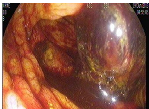
Figure 1 Sigmoidoscopy showing a large hematoma in the cecum.

was transfused aggressively with 12 units of packed red blood cells, 14 units of fresh frozen plasma, 12 units of platelet concentrate, and fibrinogen. The bleeding continued unabated despite correcting the coagulopathy. A consensus was thus reached among the intensivist, hematologist, primary cardiac surgeon, and gastrointestinal surgeon to administer rFVIIa. The patient was given 60 mcg/kg of rFVIIa as a first administration after failure of standard treatment, which resulted in prompt cessation of bleeding. He remained stable for the next 48 hours. On the 26th postoperative day, he developed another bout of melena (approximately 2 L). After the coagulation parameters had been corrected, a similar dose of rFVIIa was administered. This stopped the bleeding, and the patient gradually recovered. His anticoagulation treatment regimen was resumed after 1 week, and he had no further episodes of bleeding. His prosthetic valve function was monitored with regular transthoracic echocardiography throughout these periods of