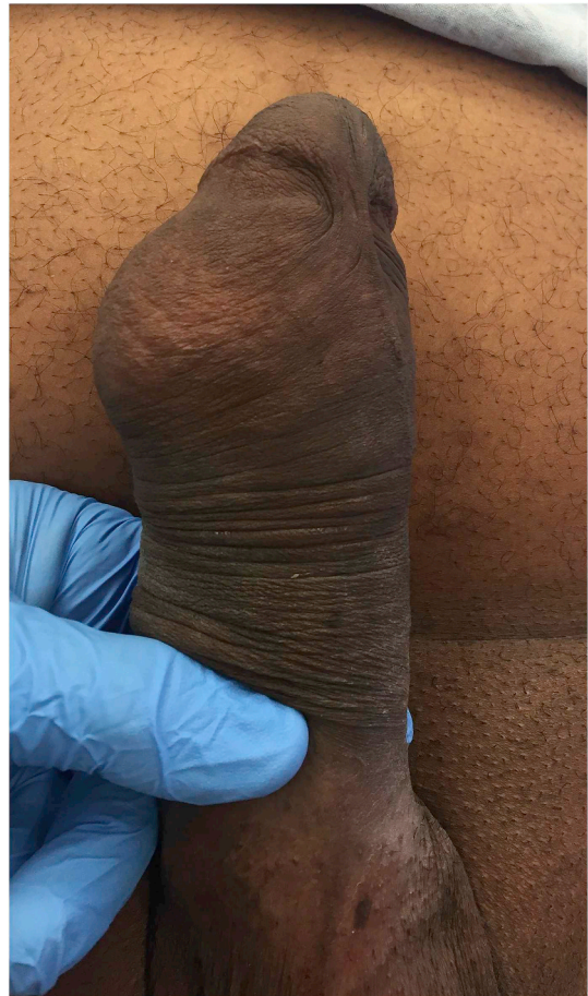
Fig. 1. Herniation/aneurysm of the right distal penile prosthesis cylinder.

The patient underwent elective removal and replacement of the inflatable penile prosthesis with a distal corporoplasty. A sub-coronal incision was made and the penis was de-gloved. A very large right corporal herniation with a tunical aneurysm was then identified. To minimize graft complications, morbidity, and cost, the corpus was repaired using the patient's existing tissue. A tunical incision was made parallel to the urethra exposing the cylinder herniation (Fig. 2). The tunica was noted to be extremely thin and weak. The lateral aspect of the tunica was folded back and sutured in an interrupted fashion to itself medially with 4–0 PDS sutures. (Fig. 3). The edge was then sutured to the medial aspect of the tunica restoring the normal cylindrical anatomic tunica. Ultimately, the penile prosthesis was replaced with a 3-piece inflatable penile prosthesis and the incision re-approximated with 3–0 Monocryl suture. The patient did well with no complications