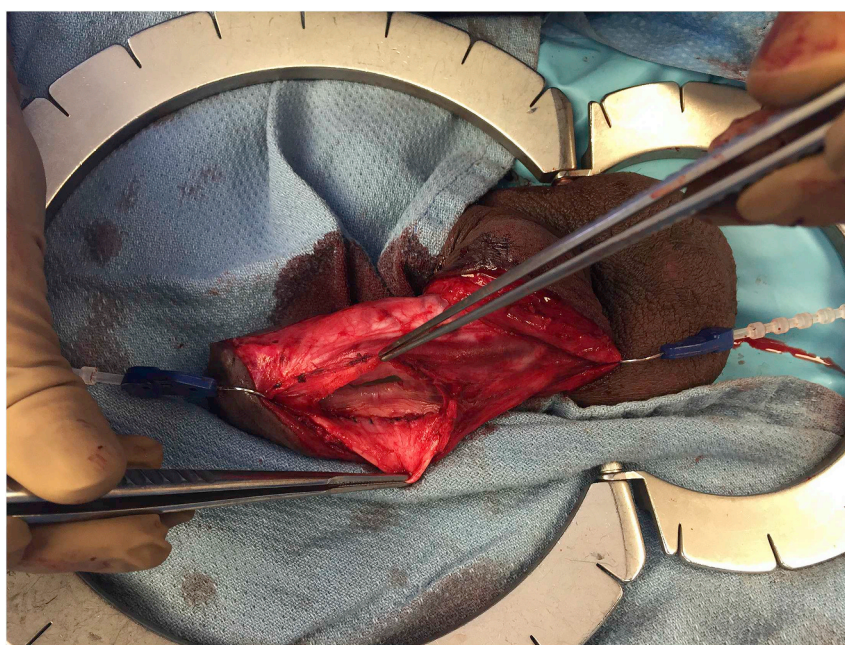
Fig. 3. Lateral aspect of tunica folded back and sutured on itself with interrupted 4-0 PDS sutures.

at his one week, 3- and 6-month postoperative visits. During his most recent visit, 2 years after his surgery, the patient elicited no urinary complaints, and no issues with his device. He reported his sexual function has returned to baseline, and is extremely satisfied with his operative outcome.