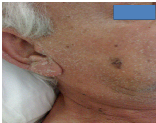
Figure 1 Scaling of the diffuse confluent erythema all over the patient's face.

artery bypass surgery 3 years before. The patient was a heavy smoker (50 pack-years), drank alcohol socially, and had no history of illicit drug use. His medications included aspirin 75 mg per day, atenolol 50 mg per day, simvastatin 40 mg per day, and bezafibrate (a fibric-acid derivative available in Europe) 200 mg three times per day, which had been started 5 years prior. Allopurinol for hyperuricemia at 300 mg per day was started 1 month prior to presentation.