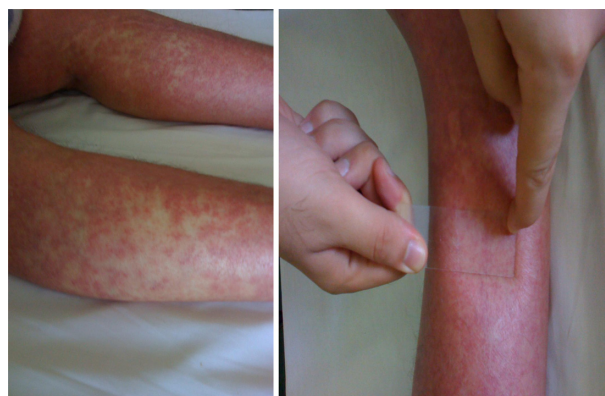
Figure 3 Spreading of the rash symmetrically to the lower extremities, purpuric type.

The allopurinol was stopped and he was started on methylprednisolone 60 mg intravenous every 8 hours. Two days later, the patient became afebrile, the dyspnea resolved, the rash improved significantly, and there was complete resolution