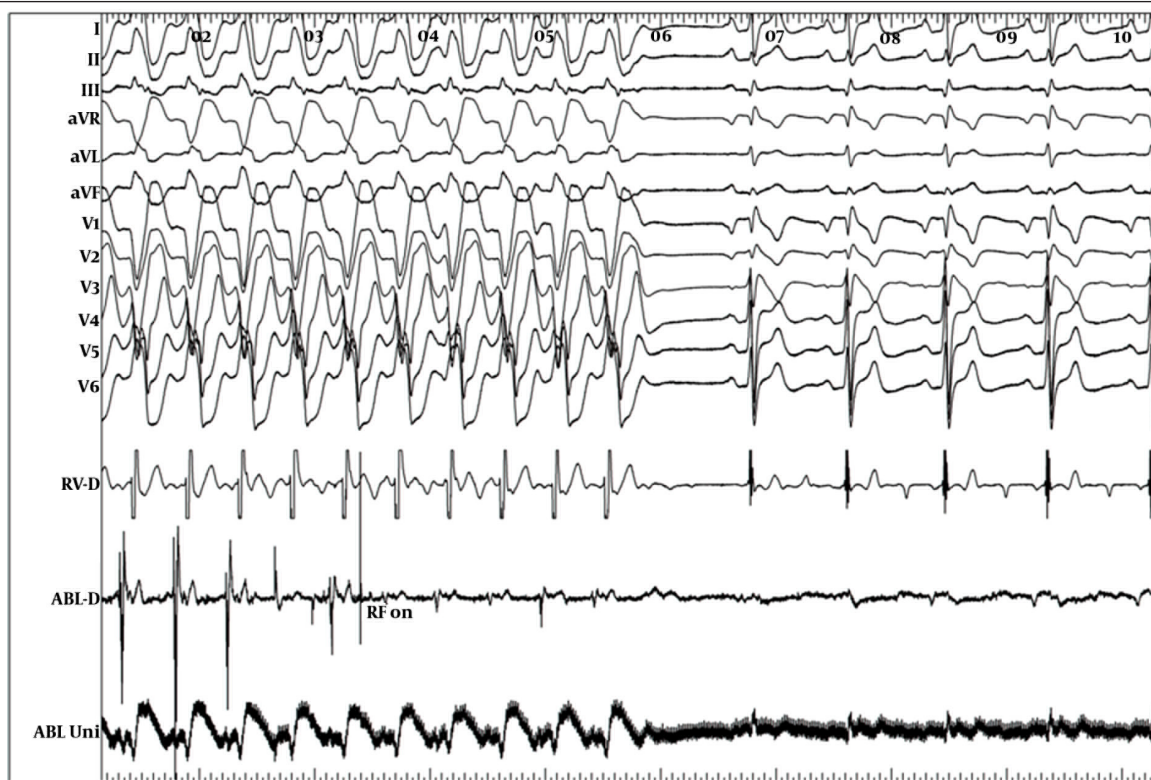
Figure 3. Tachycardia Termination by Radiofrequency Energy Application at the Site of Early Signal