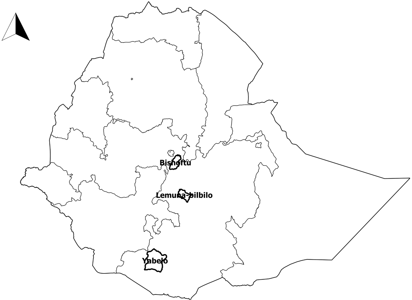
Fig 1. Map of Ethiopia showing the three study districts.

https://doi.org/10.1371/journal.pone.0192313.g001