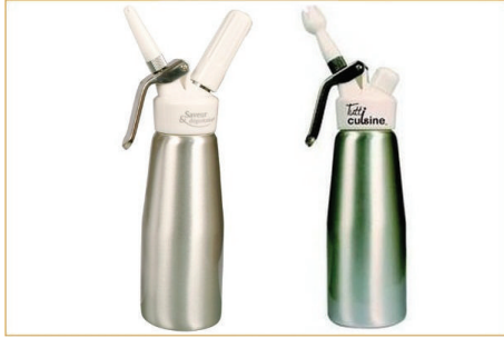
FIGURE 1: Whipped cream siphon implicated.