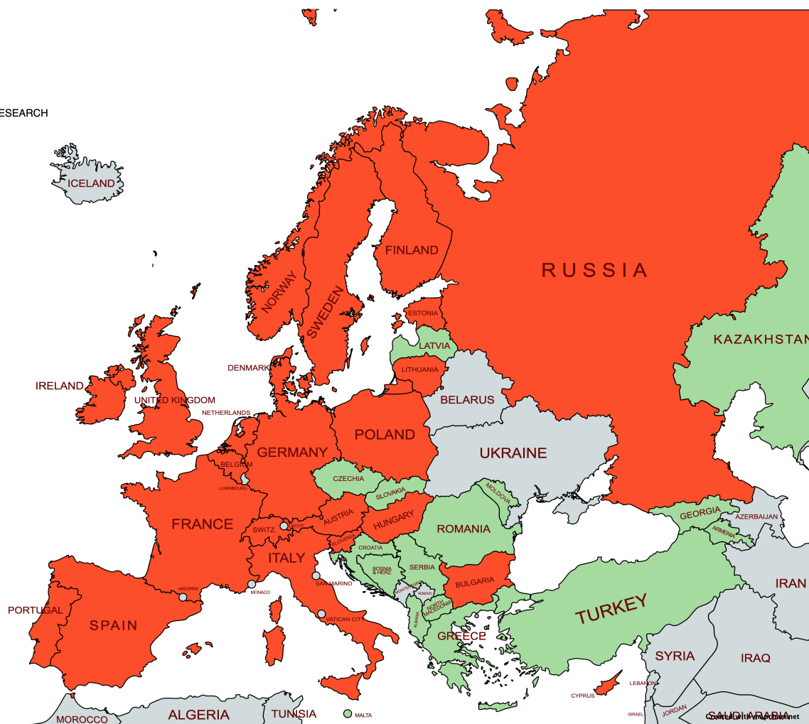
FIGURE 4 Diagnostic whole-genome sequencing (WGS) availability based on survey responders [Colour figure can be viewed at wileyonlinelibrary.com ]

expand, such as in charcot-marie-tooth disease (CMT) or dystonia, it will be important to harmonize the genes and flanking introns being tested across European and the rest of the world's diagnostic laboratories. This is a technical issue of extracting standard data from the exome or genome that each panel is taking on through a collaborative PanelApp [9].