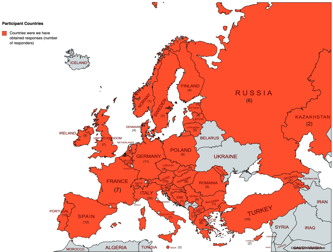
FIGURE 1 European countries (in red) affiliated with the European Academy of Neurology where we have obtained responses to the survey. Numbers in brackets indicate the number of responders per country [Colour figure can be viewed at wileyonlinelibrary.com ]

almost one-third of the responders declared they are not happy with the current way of ordering genetic diagnostic tests in their countries. As an example, polymerase chain reaction (PCR) fragment analysis and other techniques for repeat disorders are available in 40% of cases for limited common expansions diseases. Moreover, although single-gene analysis is diffusely present in European countries, whole-genome sequencing (WGS) is not easily accessible for more than 60% of responders. The European situation appears to vary from country to country with respect to access to next-generation sequencing (NGS) panels, whole exome sequencing (WES), and WGS, where most of the differences are between Western and Eastern Europe (see Figures 2, 3, and 4 ). Both the discrepancies and completeness of the acquired data among countries cannot be deeply evaluated in this survey due to the limited number of answers we have collected.