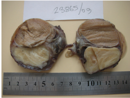
FIGURE 1: Gross pathological view of the testis and epididymal tumor.