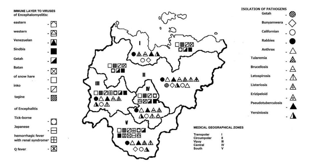
Figure 1. Data on the spread of natural focal infections of bacterial and viral aetiology on the territory of the Republic of Sakha (Yakutia).