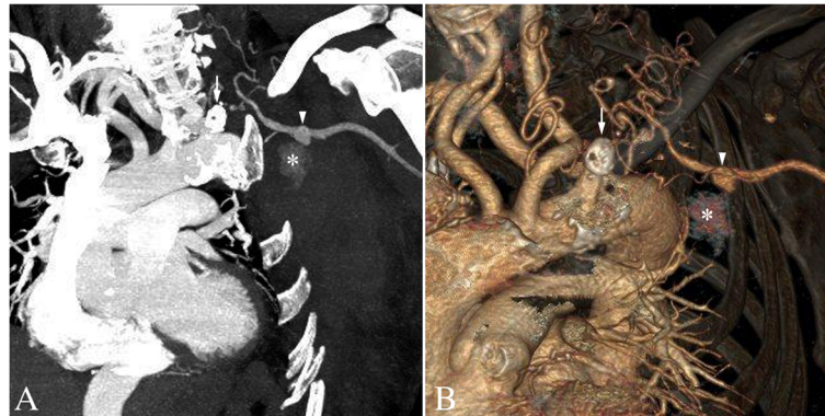
Figure 1 Contrast-enhanced computed tomography of aneurysm of the left subscapular artery. Oblique maximum intensity (A) and volume rendering (B) projections of contrast-enhanced computed tomography show a 1cm-diameter aneurysm of the left subscapular artery (arrowheads), associated with a blush of contrast agent (asterisks). More proximally, there is an extensively calcified chronic total occlusion of the proximal left subclavian artery (arrows). Of note, there is an aberrant origin of the right subclavian artery.

a 2.7 French microcatheter (Progreat™, Terumo Europe, Leuven, Belgium). It was embolized with 0.018 Inch microcoils (Tornado™ Embolization Microcoils, Cook Europe, Bjaeverskov, Denmark). Afterward, we packed the aneurysm and finally embolized the efferent artery with the same coils. Postembolization angiography revealed complete occlusion of the aneurysm. The axillary artery and its different branches were permeable and remained supplied by the collateral network (Figure 2B). Clinical evolution was excellent and our patient was discharged without further event on day four postembolization.