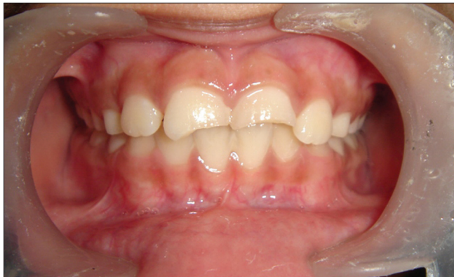
Figure 5: Preoperative photograph (case II)