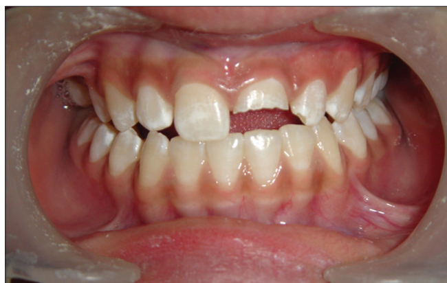
Figure 1: Ellis class III fracture on 21 (case I)

A 9-year-old girl reported to our OPD with coronal fractures in both maxillary central incisors due to a fall while climbing