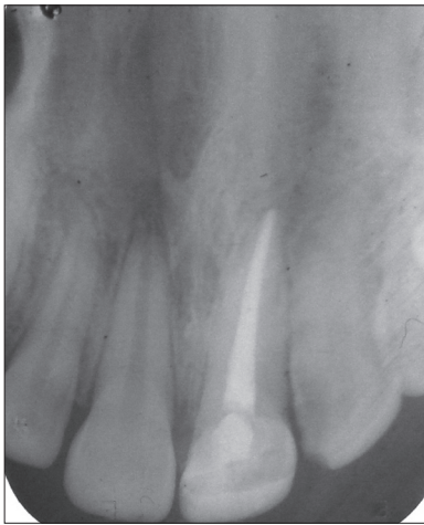
Figure 3: IOPA radiograph after RCT (case I)