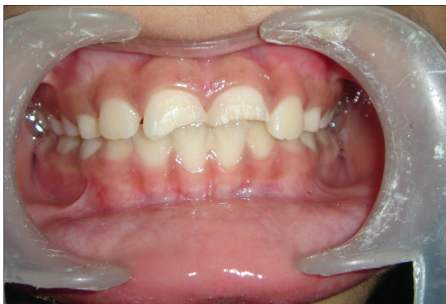
Figure 7: Teeth with intra enamel bevel (case II)