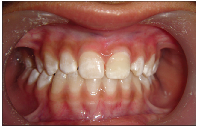
Figure 4: Postoperative photograph (case I)