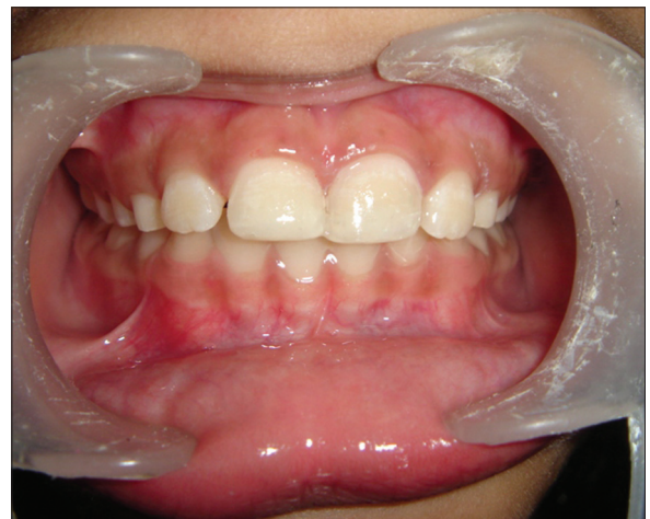
Figure 8: Postoperative photograph (case II)

in 1964, [7] where the authors had reattached the fractured fragment using post and core. The fragments have also been attached with dentinal pins. [9]